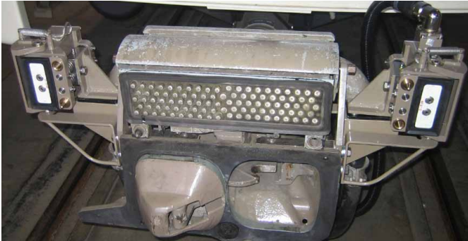
Refurbishment of a metro

The era-transceiver® is used as an interface for the high-speed data transfer between carriages of rail vehicles. The system we supply can be retrofitted quickly and easily to existing vehicles. This solution ensures you all the benefits of flexibility in rail traffic. The era-transceiver® can be used for refurbishment purposes and, of course, for new vehicles.